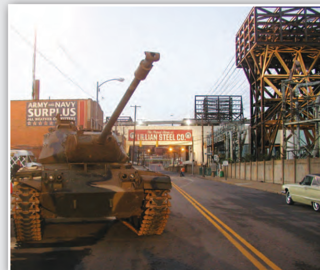
In a brilliant performance, the M41 Walker Bulldog light tank maneuvers the streets of Weirton, West Virginia, during production of “Super 8.”